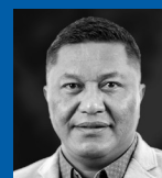
Kalani Kaneko Senator, Republic of the Marshall Islands